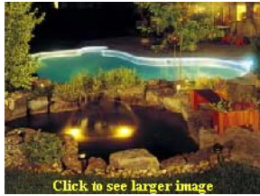
Side emitting cable highlighting the side of a pool.

There are many applications for fiber optic lighting around - or even in - your pool or spa.