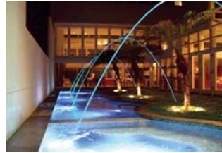
The laminar effect. A glasslike rod of water.