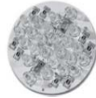
LED Replacement Lamp