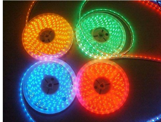
Single Color LED Flat Ribbon

30W - Outdoor 60W - Indoor 100W - Indoor 100W - Outdoor 150W - Outdoor 200W - Indoor 300W - Indoor