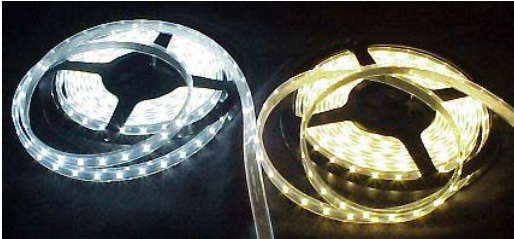
Pure and Warm White LED Ribbon

The waterproof LED flexible ribbon incorporates a silicon flexible circuit board and SMD LED technology. It can be bent to a maximum radius of 2cm. The SMD LED's are dimmable (255 levels) and color controllable using linear modulation covering the entire RGB visual spectrum Power: 12V, Max power=7.2W/m 5M roll = 3A for 3 color, 2A for single color Dimensions: 8mm x 0.25mm Beam Angle: 120° 5M (16.4') roll with 30LED/M.