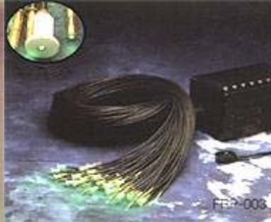
The DIY35 kit.