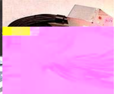
The DIY50 DMX kit