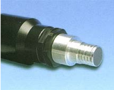
An example of a pre-assembled fiber bundle

These kits are similar to the LED mini-light system, but they utilize a conventional illuminator. The cable has been prepared for you and only needs to be plugged into the illuminator. The kits come with varied lengths of cable for your convenience.